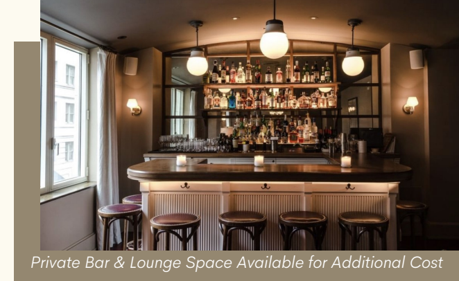
Private Bar & Lounge Space Available for Additional Cost

The Love is committed to Seasonal, Creative and Locally Inspired Menus